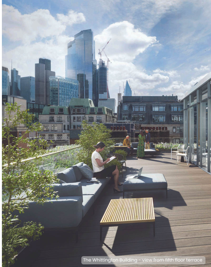
The Whittington Building – view from fifth floor terrace