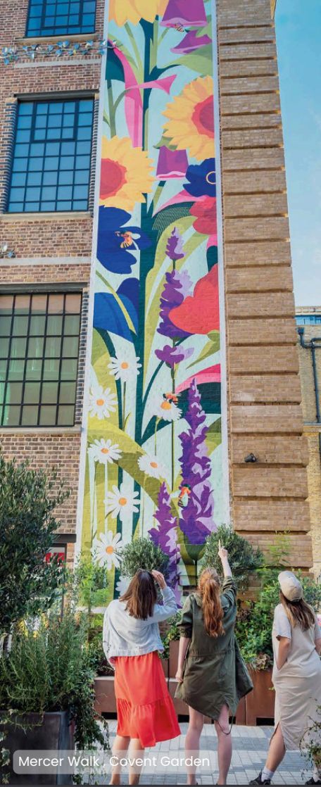
Mercer Walk, Covent Garden